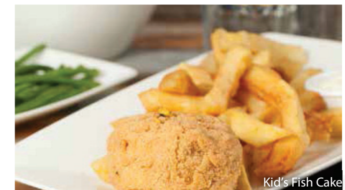
Kid's Fish Cake