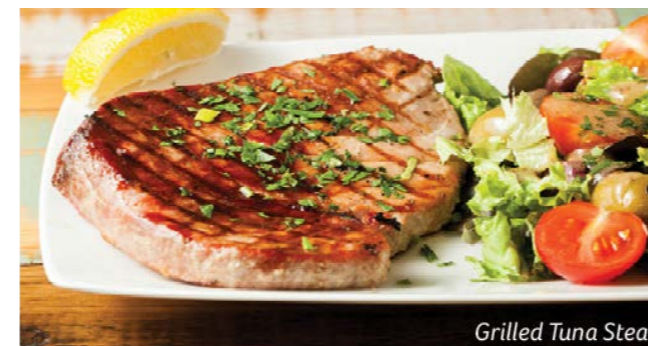
Grilled Tuna Steak